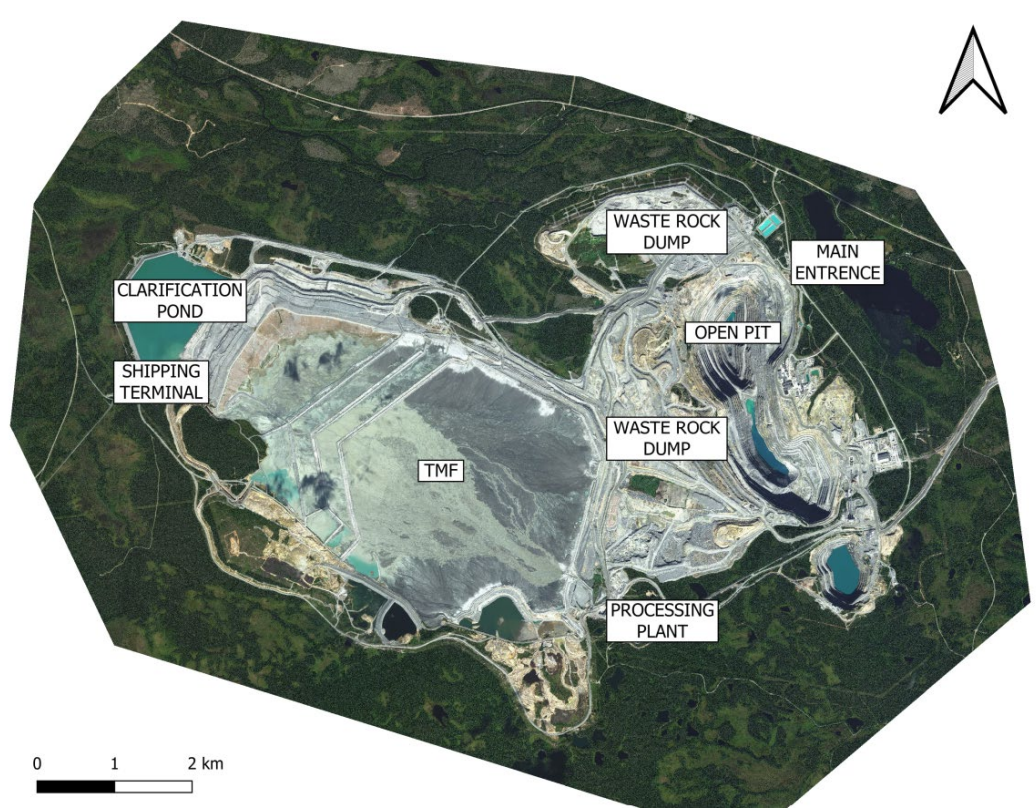
Figure 2 Aerial photo (August 2024) of the Aitik mine